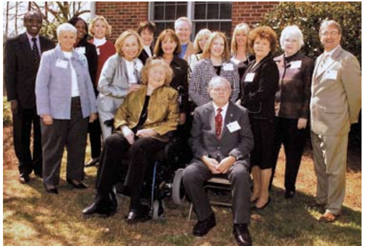
Past and present members of the Board of Trustees

Alice's House marked its 10th Anniversary on March 7th. Community supporters and former and present Board members took part in the celebration.