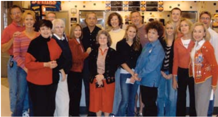
Board members and volunteers joined the children in their Christmas shopping trip to Target.

The staff and children of Alice's House held a special appreciation dinner for the Board on Wednesday, Feb. 27, 2008. The children performed songs they learned for the event and joined the Board for a delicious dinner.